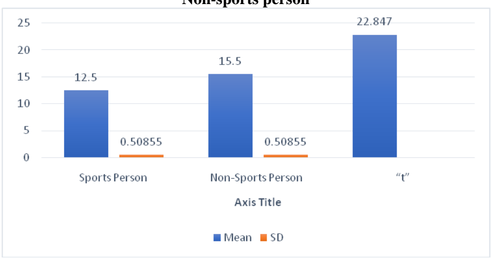
Fig. 2: Graphical representation of agility among sports person and Non-sports person

The table-2 reveals the insignificant differences of agility between the sports person and non-sports person, as the calculated value of 't'= 22.847 was less than the tabulated t.05 (58) = 2.000.